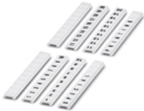
Zack marker strip flat, 10-section, vertically labeled with the consecutive numbers: 11 ... 20, white

Please be informed that the data shown in this PDF Document is generated from our Online Catalog. Please find the complete data in the user's documentation. Our General Terms of Use for Downloads are valid ( http://phoenixcontact.com/download )